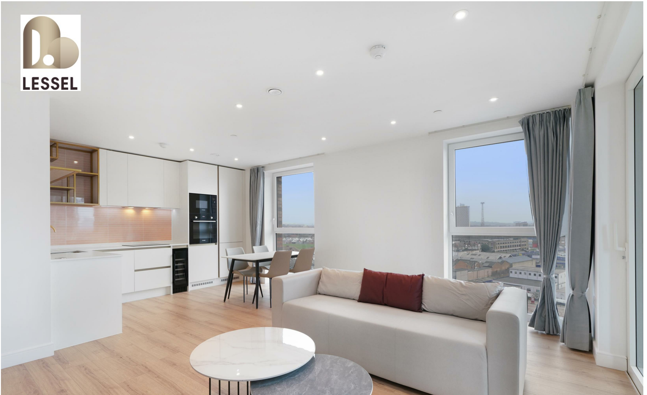
53 Waterview House 12 Quay Walk, Wembley, London, HA0 1BE £530 Per Week